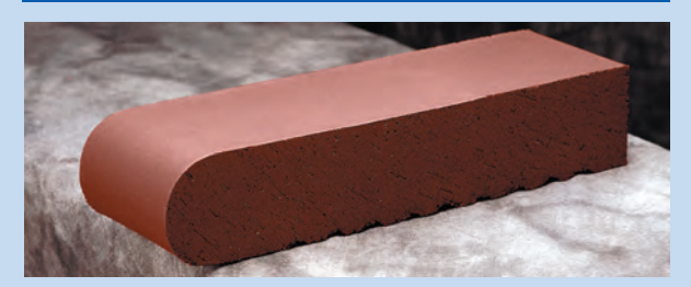
35/8 x 11 5/8 x 2 1/4