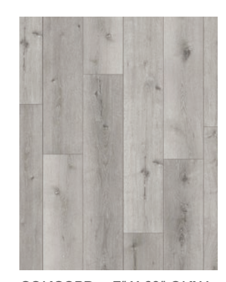
CONCORD - 7" X 60" ONLY