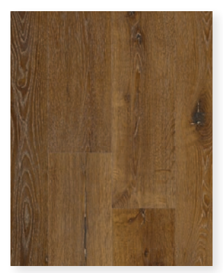
LEXINGTON - 7" X 60" ONLY