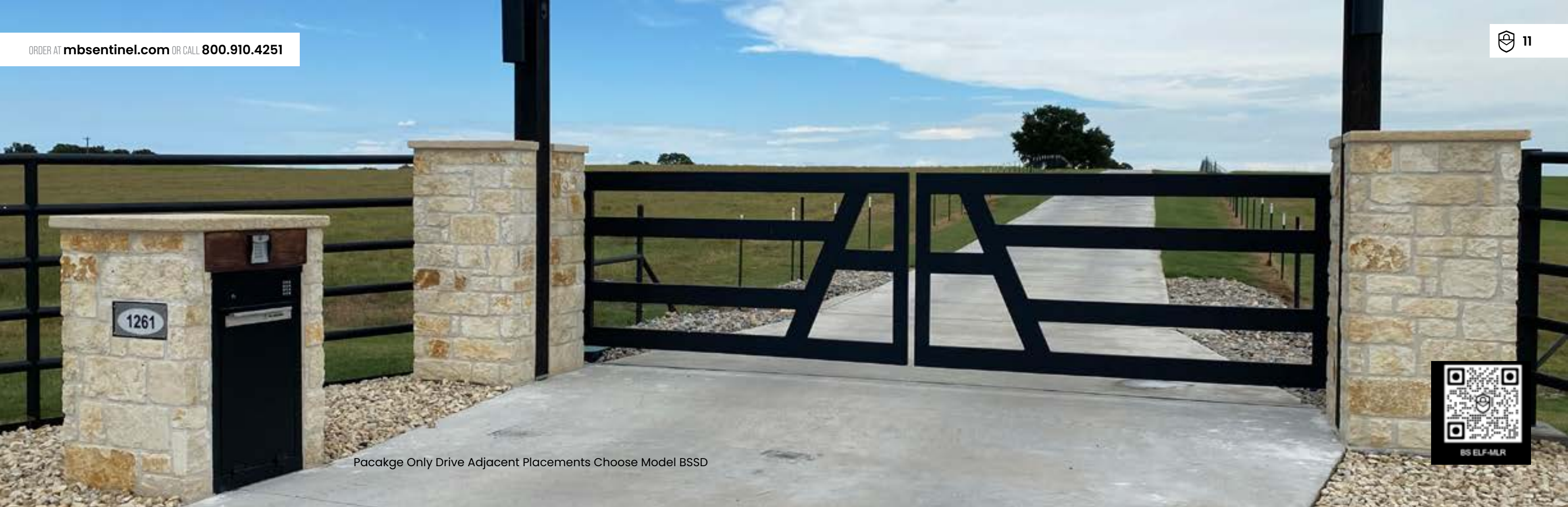
Package Only Drive Adjacent Placements Choose Model BSSD