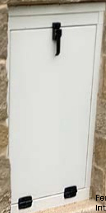
Fence & Column Integrations Choose Model BSDD (Rear View)