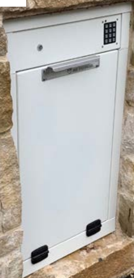
Fence & Column Integrations Choose Model BSDD (Front View)

ORDER AT mbsentinel.com OR CALL 800.910.4251