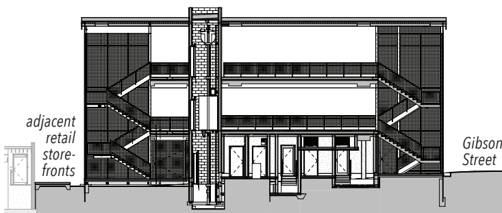
section, facing north (above left) section, facing east (left) at circulation plan, 2nd floor, office level (above)