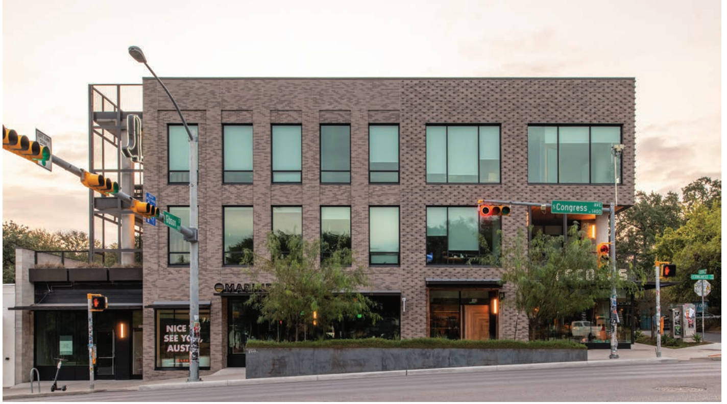
west elevation; below: street view from northeast